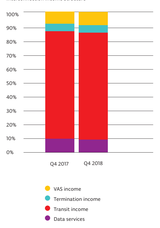
Data Source: Company's business records

tners, where we responded to market requests accordingly.